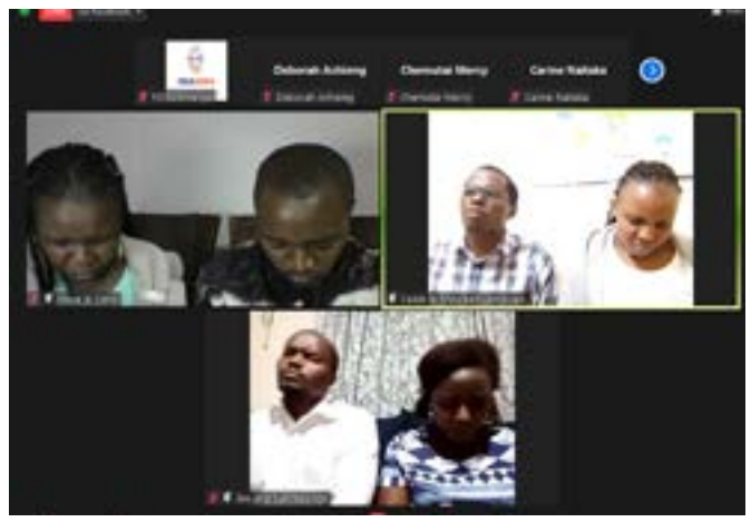
Panelists in Purity night 2 praying for the students and associates