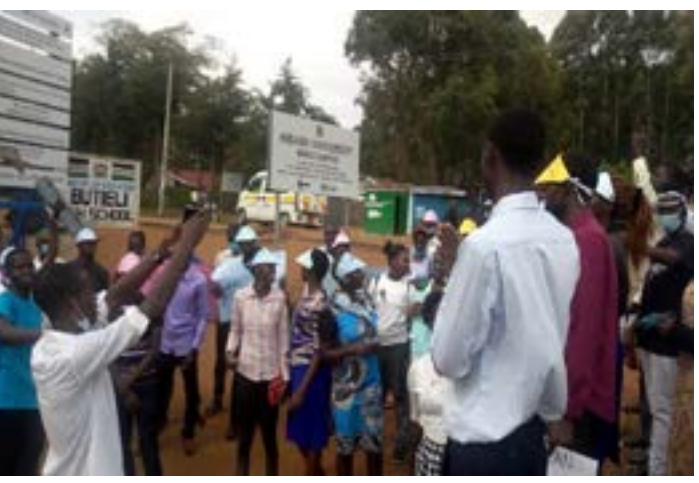
Kibabii University CU campaigning for purity in Kibabii