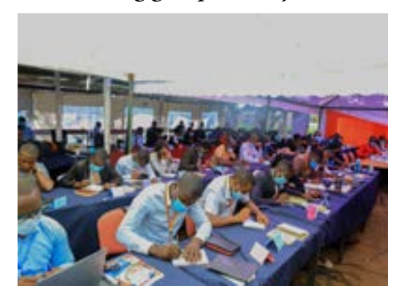
SOT plenary sessions