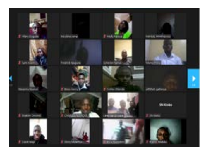
Purity Night 1 zoom audience during Chastity week