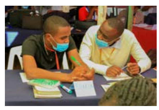
In session discussions during SOT

The Lord has expanded the laborers in the ministry further. 30 Associates from across the country have volunteered to serve as volunteer staff (FOCUS Associate Staff) in various Christian Unions. They are coworking with the CMFs and STEM staff in increasing the reach to students for greater impact. Praise God for supplying more laborers and pray for a fruitful service for the staff