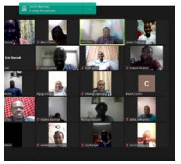
Virtual Mini-Kesha during the prayer and fasting