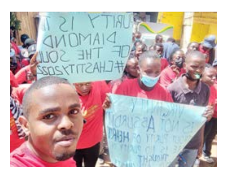
JKUAT-CU students advocating for purity around Juja.