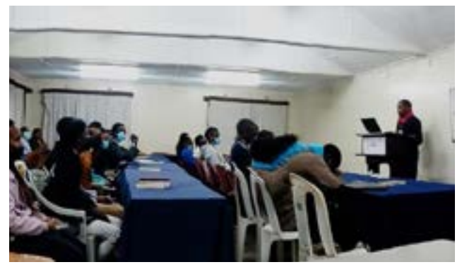
Opening session during Northern Nairobi's RSEC gathering