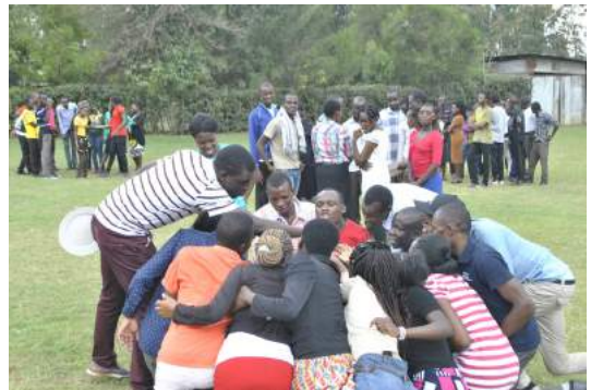
Team Building activities during the mentorship day in Eldoret