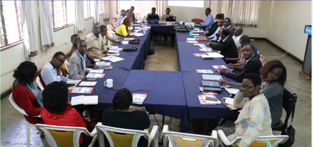
Mission Agencies in a meeting at FOCUS Centre for Commission Follow-up

We shall regularly communicate with the individual delegates who made specific commitments with an aim of receiving feedback, networking and possible placements.