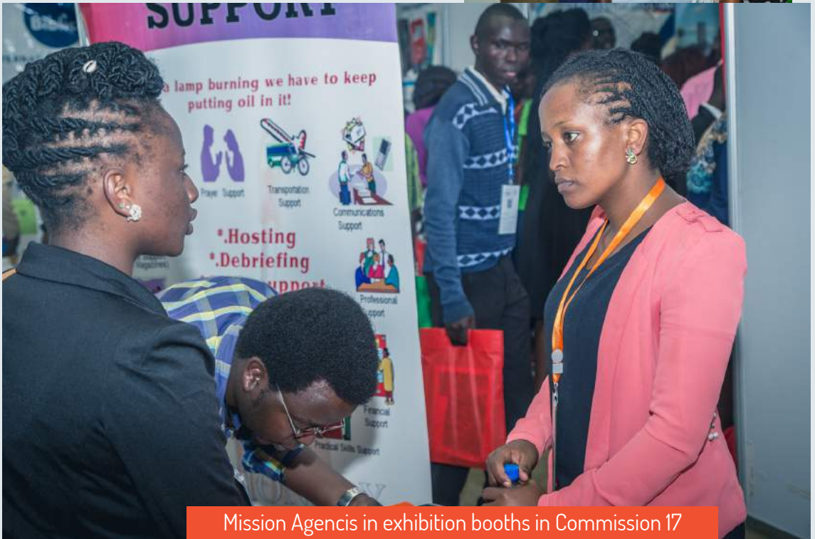
Mission Agencies in exhibition booths in Commission 17