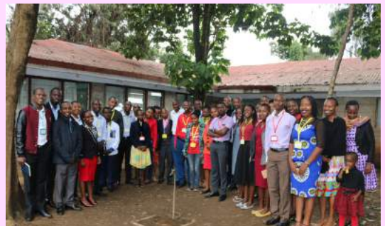
Northern Nairobi RSEC at FOCUS Centre