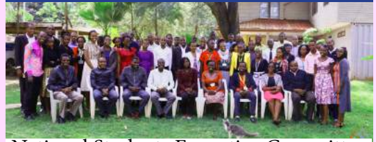
National Students Executive Committee at FOCUS Centre in March 2018