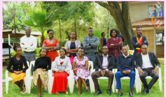
NASEC Officials 2018