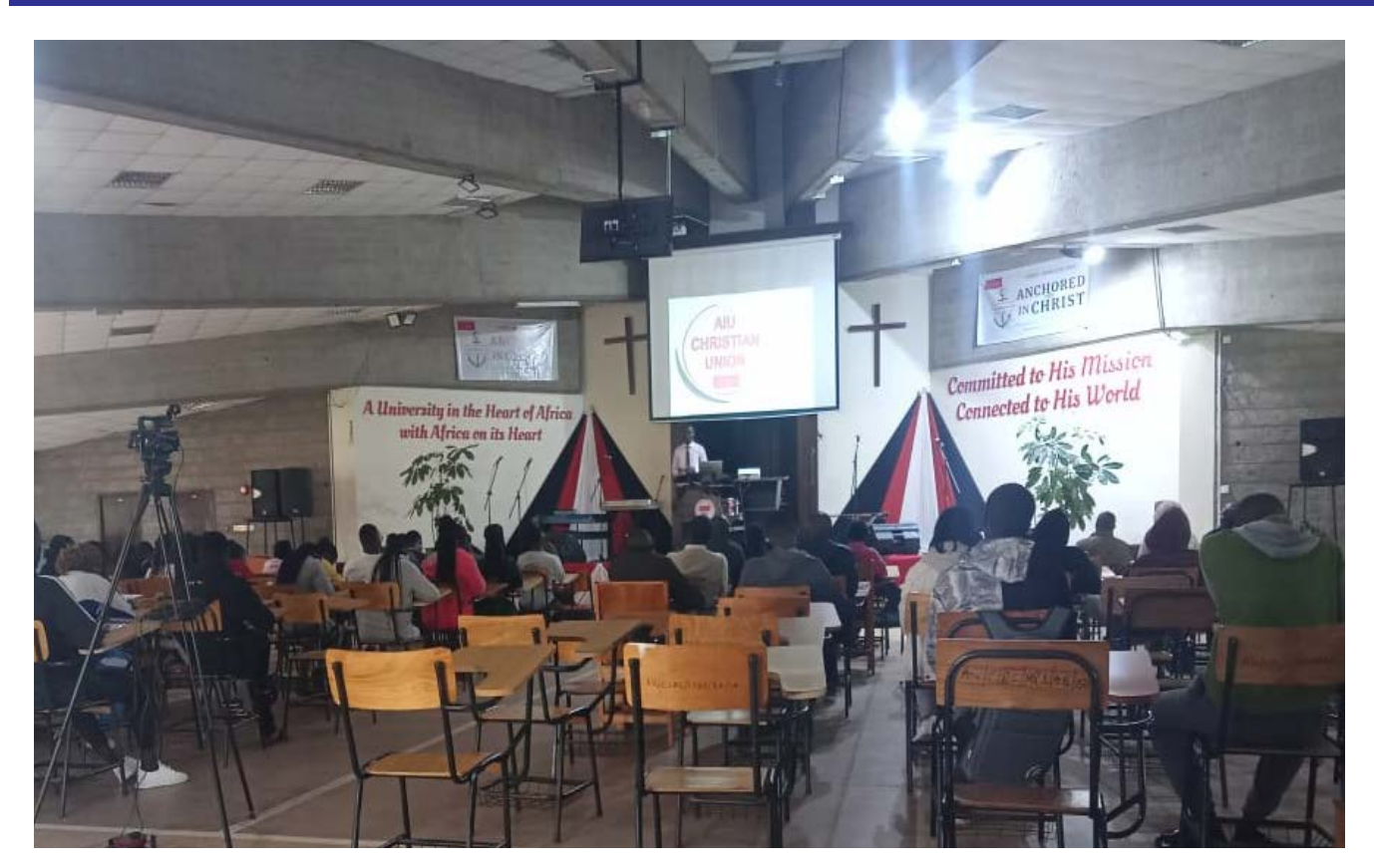
Orientation done to new students at Africa International University