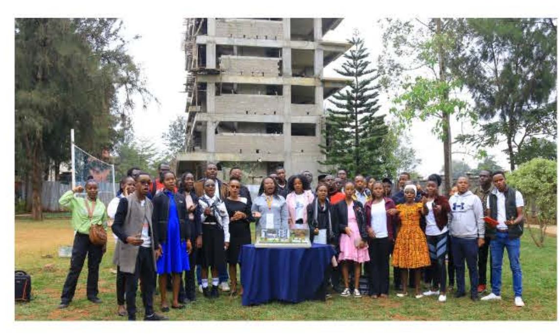
Hatua Breakfast in August (Nairobi)