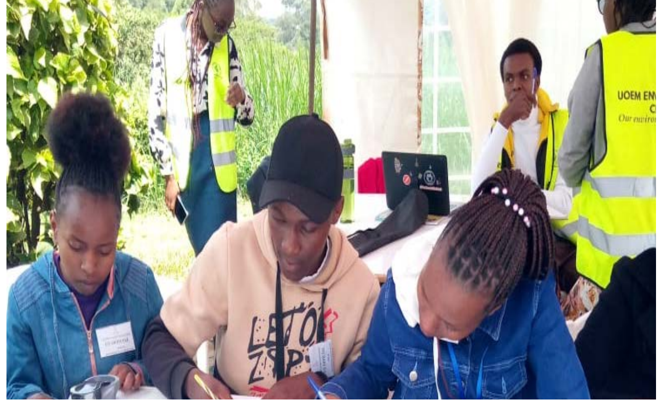
First-Years Registration desk in Embu University CU