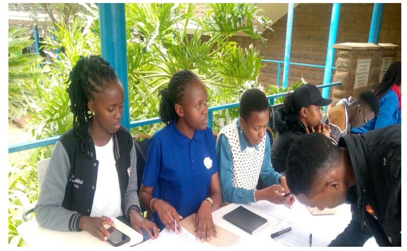
First-Years Registration desk by Cooperative University CU