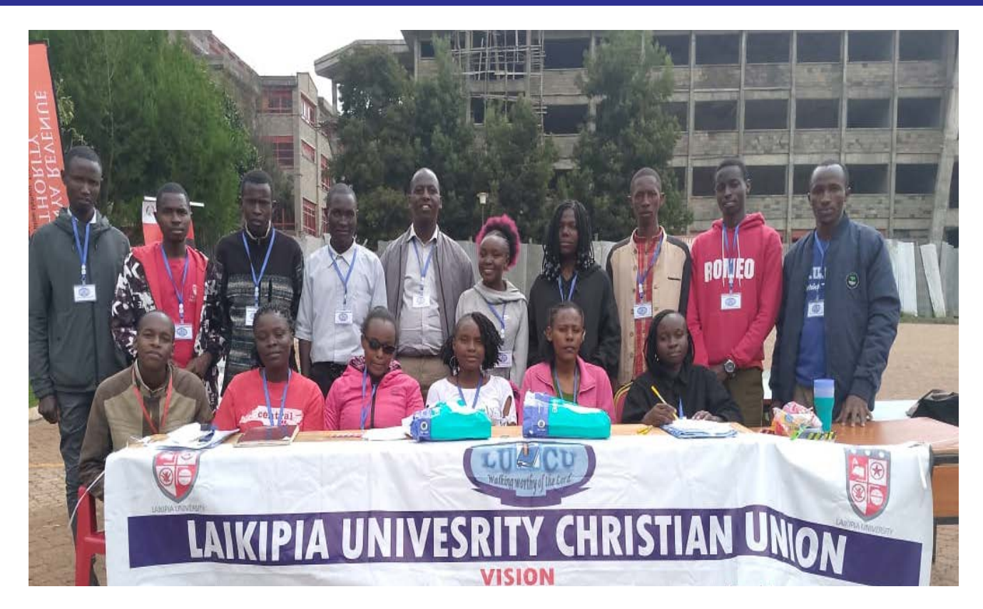
First-Years Registration desk at Laikipia University