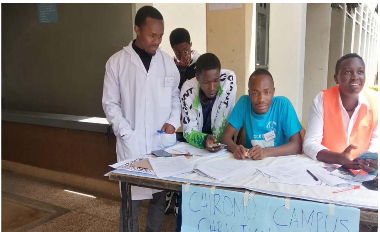
First-Years Registration desk by Chiromo Campus CU