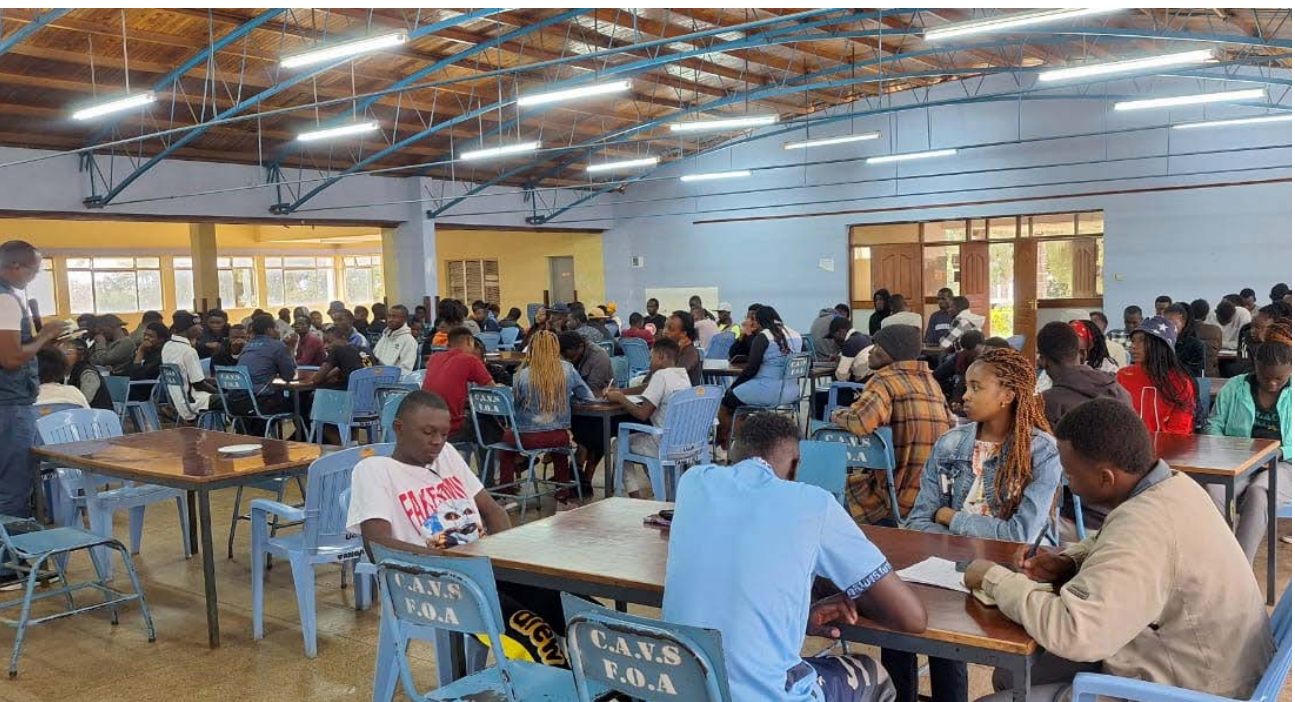
First-Years in Upper Kabete CU having a breakfast with associates in the cafeteroa.