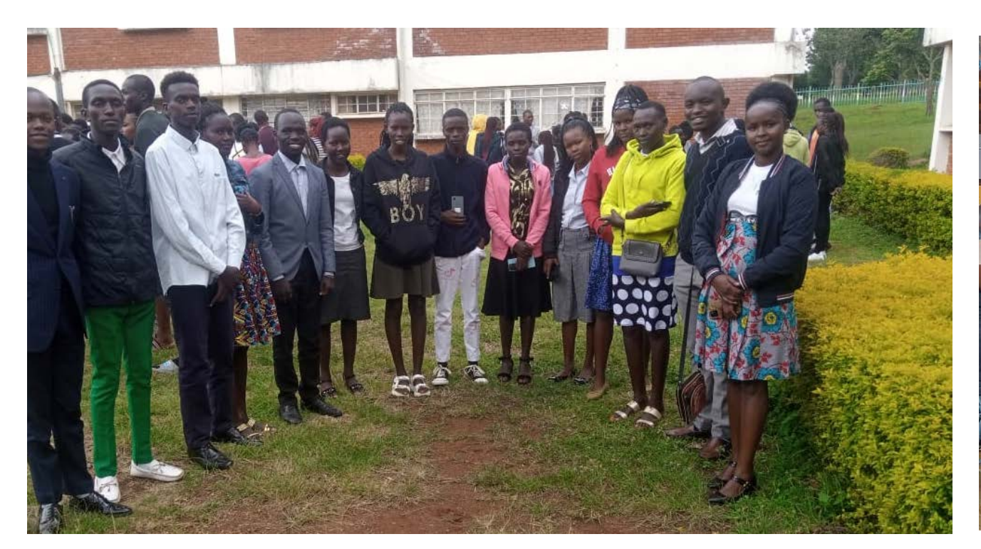
First-Years in Moi University after being assigned small groups for accountability