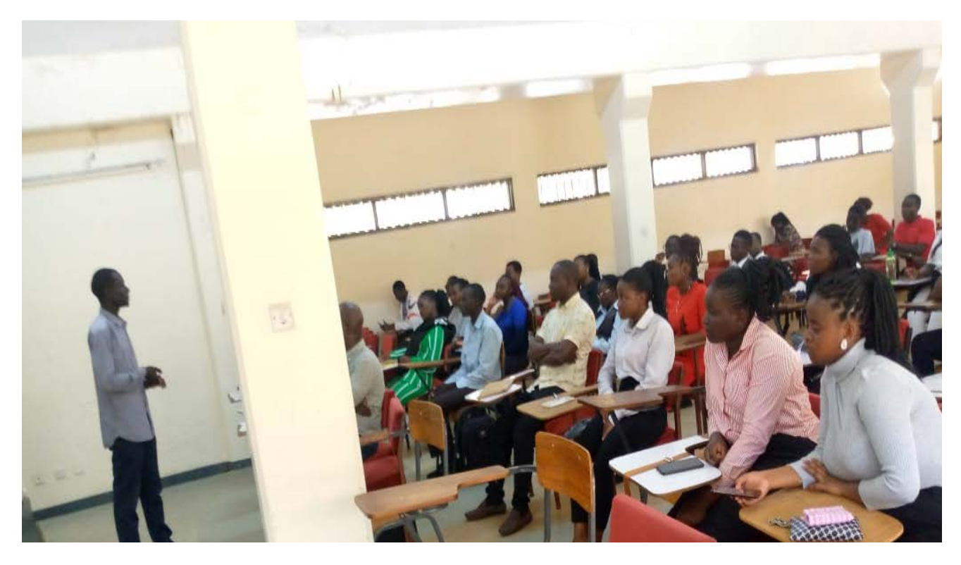
Orientation Week session at Kenyatta University CU