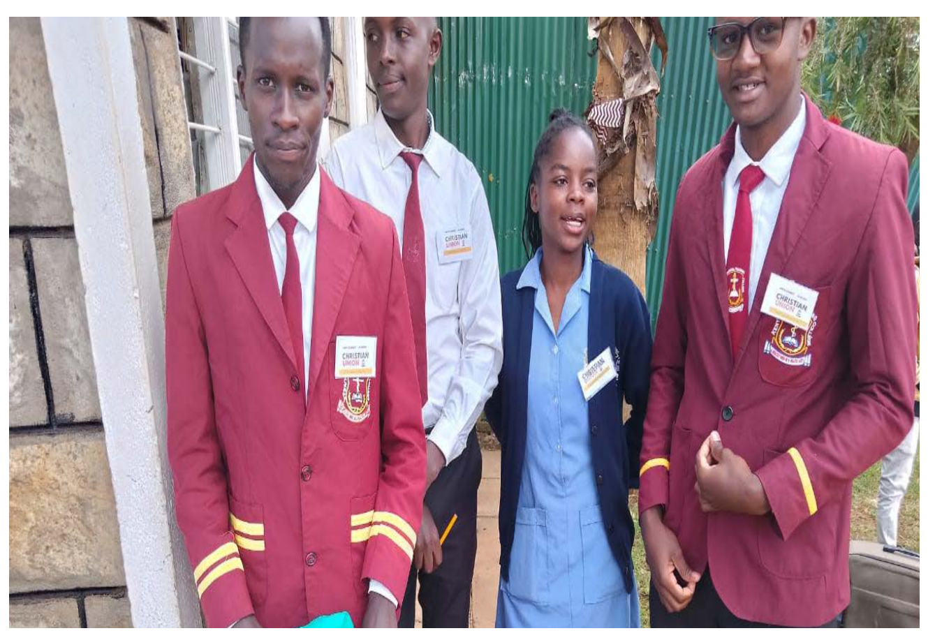
First-Years Orientation team at KMTC Eldoret CU after their training