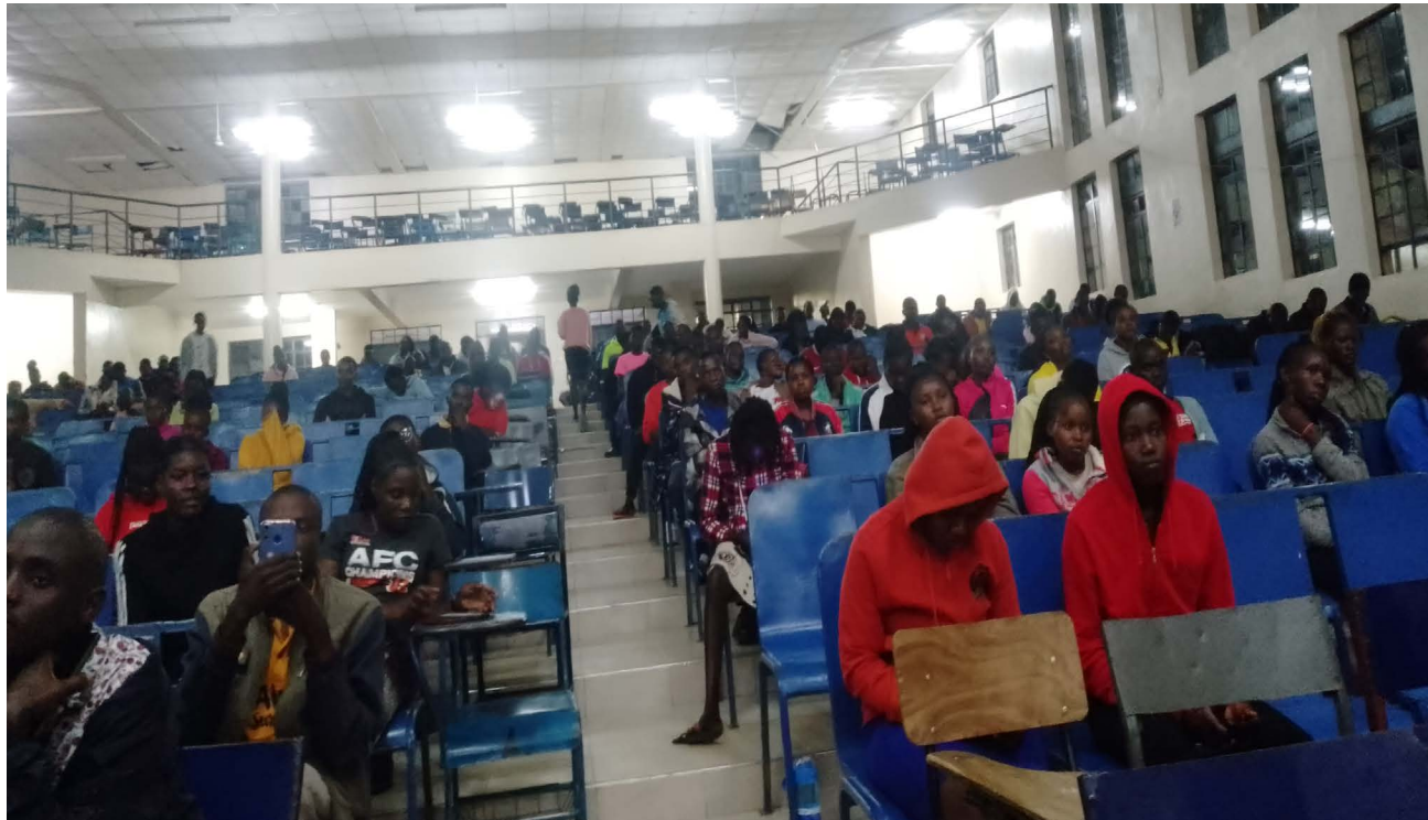
Orientation Week session at Kibabii University CU