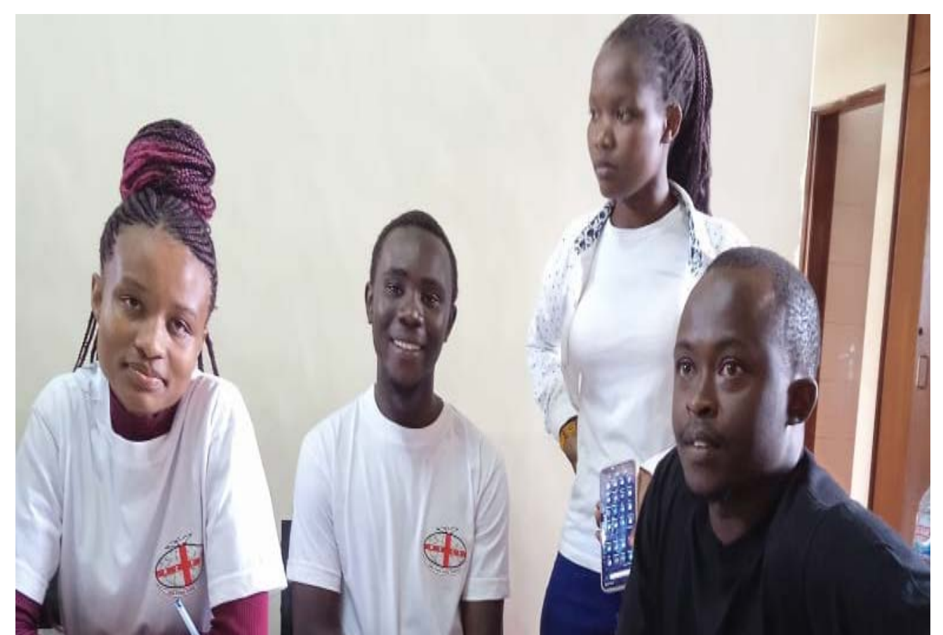
First-Years Registration desk by UON Kikuyu Campus CU